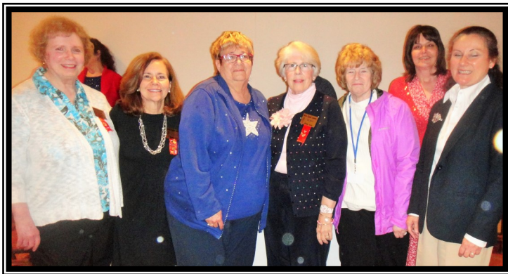
The May Committee

To ALL of you, for your love and support!